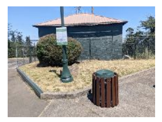
Trimmed hedge and weed whacked low planter at parking lot. Painted steel curb edging