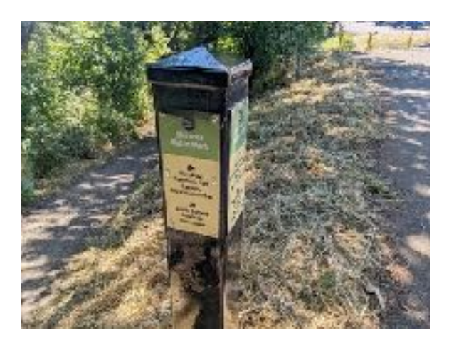
Painted over graffiti at multiple way markers

Painted over graffiti on Skinner Butte plaque