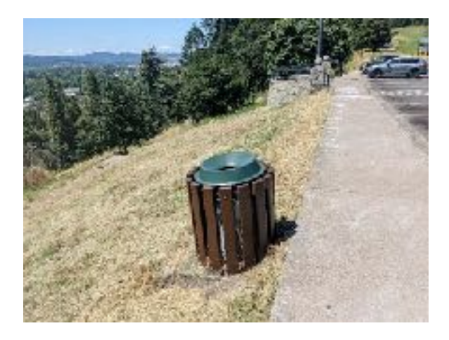
Painted multiple trash enclosures