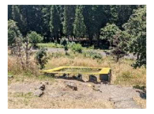
Painted Big O and painted the stanchions supporting the O

Painted west overlook picnic table (and repainted twice more to cover graffiti)