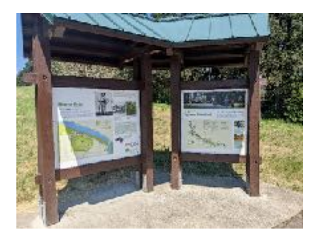
Painted over graffiti at kiosk