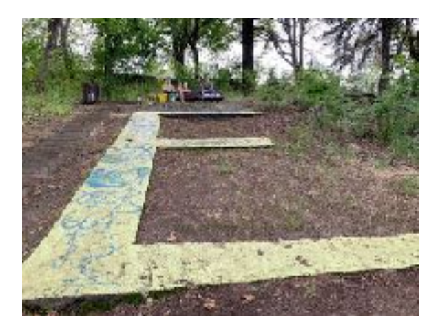
Painted the Big E bench and trash enclosure (top of picture)