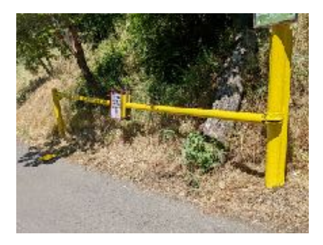
Painted gate at entrance the Skinner Butte summit