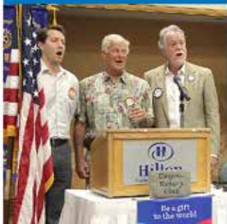
Sing about doing good