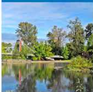
Parks and Open Spaces