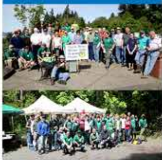
Skinner's Butte Clean-up