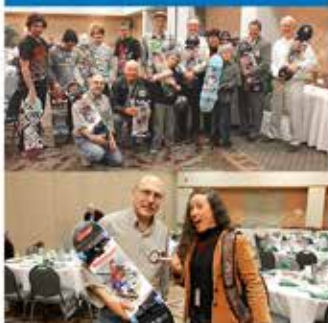
WJ Skatepark Project